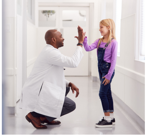
TOGETHER, WE CAN STRENGTHEN AND PROTECT THE FUTURE OF FAMILY MEDICINE.